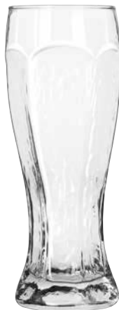
Giant Beer No. 2478 ● 22¾ oz./67.3 cl./673 ml. H9½ T3¼ B3½ D3¾ 1 doz./16# • .96 cu. ft. SCC 575978