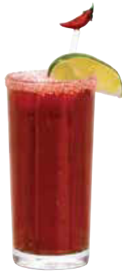
Beverage No. 1790845 12 oz./35.5 cl./355 ml. H5½ T2¾ B2¼ D2¾ 2 doz./20# • .77 cu. ft. SCC 17908457