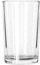
Tumbler No. 1795441 10½ oz./31.5 cl./315 ml. H4½ T3 B2½ D3 2 doz./18# • .71 cu. ft. SCC 17954416