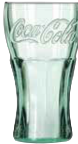
Coca-Cola Genuine Tumbler No. 2216CC ● 16¾ oz./49.5 cl./495 ml. H6½ T3¼ B2¾ D3¾ 1 doz./9# • .63 cu. ft. SCC 280081

COKE® brand glassware is produced for The Coca-Cola Company, owner of the trademarks COCA-COLA, COKE, the design of the contour glass, and Always Coca-Cola by Libbey Inc., an authorized user. ©The Coca-Cola Company. All rights reserved.