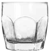
Rocks No. 2485 ● 10 oz./29.6 cl./296 ml. H3¾ T3¼ B2¾ D3¾ 3 doz./24# • 1.12 cu. ft. SCC 753819