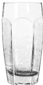
Cooler No. 2486 ● 16 oz./47.3 cl./473 ml. H6½ T3 B2¾ D3¼ 3 doz./28# • 1.68 cu. ft. SCC 753833