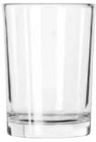
Tumbler No. 1789821 9 oz./27.0 cl./270 ml. H4 T2½ B2½ D2½ 2 doz./15# • .60 cu. ft. SCC 17898215