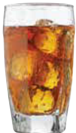
Beverage No. 2488 ● 12 oz./35.5 cl./355 ml. H5¼ T2¾ B2¼ D3½ 3 doz./26# • 1.33 cu. ft. SCC 753857