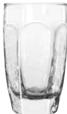
Beverage No. 2489 ● 10 oz./29.6 cl./296 ml. H4¾ T2¾ B2¾ D3 3 doz./20# • 1.13 cu. ft. SCC 744688